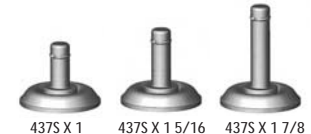
437S X 1