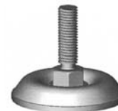
Threaded Stem HN