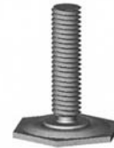
Threaded Stem HW