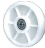
NYHD -30° to 248°F 75D +/-3