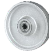
SSC -44° to 180°F (Standard) Consult CWBC for temperatures to 800°F 95-98 Shore D