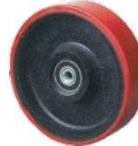
UR -40° to 194°F 95A +/-3