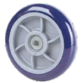
PLY -40° to 194°F 95A +/-3