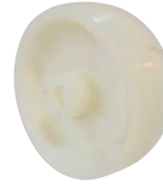
NY -35° to 248°F 75D +/-3