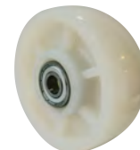
NY-BB -35° to 248°F 75D +/-3