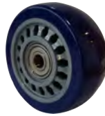
ETU -40° to 194°F 95A +/-3