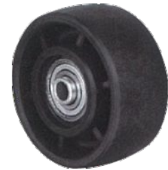
GFN -30° to 212°F 85D +/-5 Glass Filled Nylon